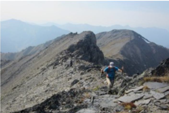
Final approach to Texas Peak