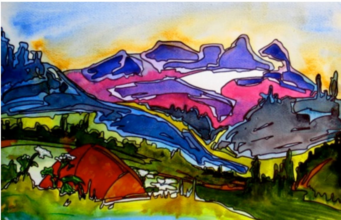
"Chad's Tent" - looking south