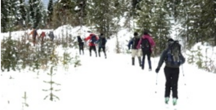
The lower route into View Point Cabin

Twelve of us met at the Nancy Greene Summit Parking lot, most as a first ski of the season. The weather reports have been predicting enormous amounts of snow for the coming days, but today was still early snow conditions with not a lot of snow depth. Still it was fun to get out and ski the logging roads and a