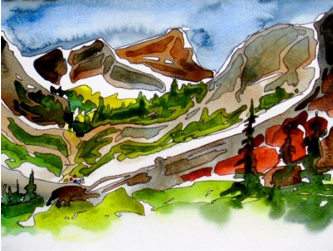
"Painter's Point" - looking down on camp and over to Muir Mountain